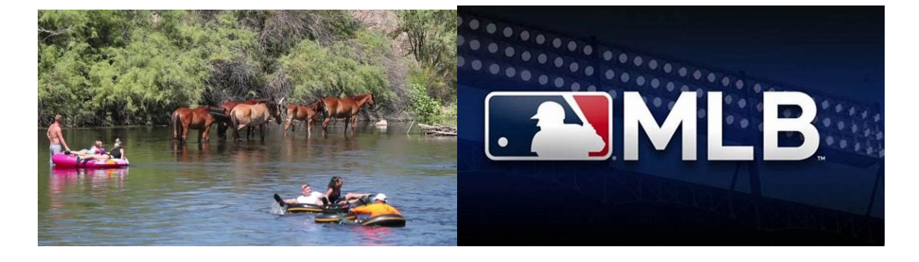
Day 9: Friday, March 21. Depart on direct Westjet flight from Phoenix, Arizona to YVR Vancouver at 1:15pm. Arrive in Vancouver at 4:36pm. Return to SRT.