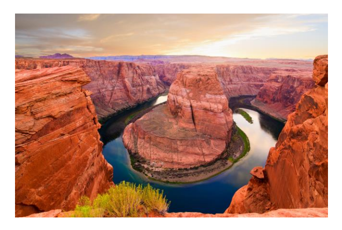
Day 5: Monday, March 17. Continued Grand Canyon Exploration – Sedona Region. Tlaquepaque Village (Mexican crafters and artisans)