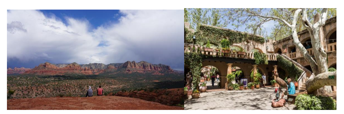
Day 6: Tuesday, March 18. Hiking in Sedona. Explore Historical Ghost town Jerome. Entrance to National Park. See old artifacts when you walk back in time. Guided river kayaking or horseback riding by certified guides. Nighttime stargazing.